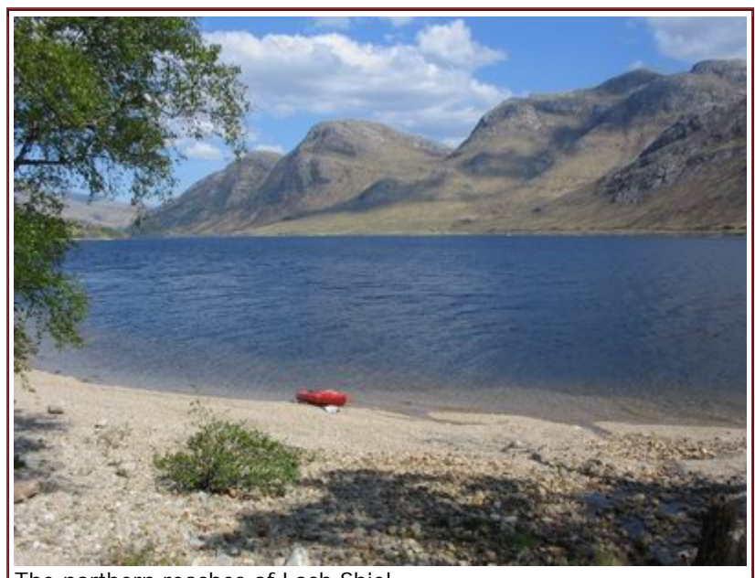
The northern reaches of Loch Shiel.